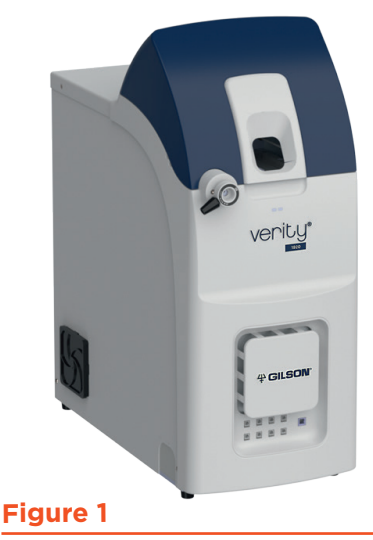
VERITY® 1920 Mass Spectrometer

The single quadrupole VERITY 1920 Mass Spectrometer delivers high sensitivity and selectivity for reproducible fraction collection. Save valuable time and maximize productivity by combining the power of mass detection with the fraction collection options offered by VERITY® CPC systems from lab- to pilot-scale.