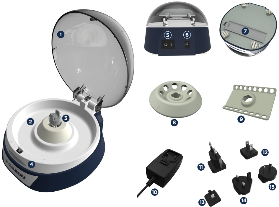
Figure 1 CENTRY™ 103 Minicentrifuge components