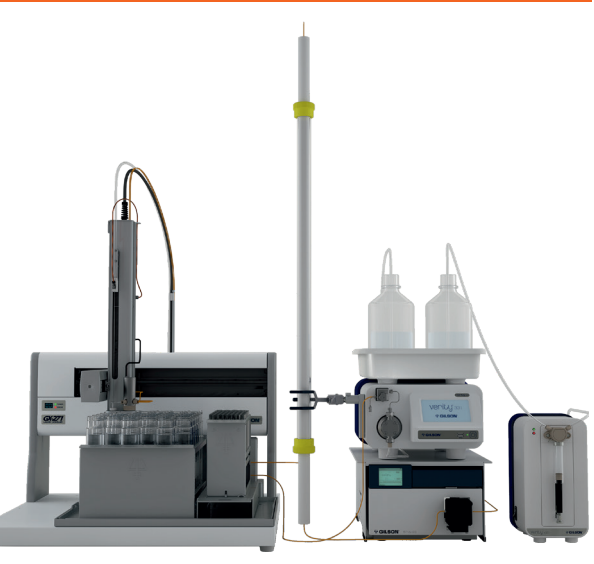
Figure 1 VERITY® GPC Cleanup System