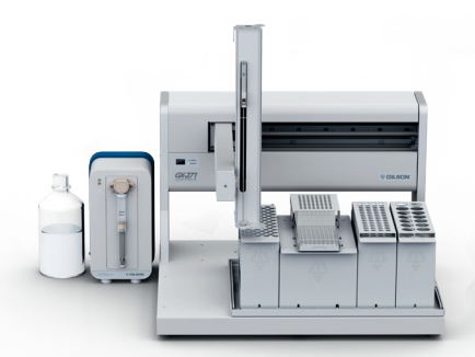
VERITY® 4020 Syringe Pump and GX-271 Liquid Handler