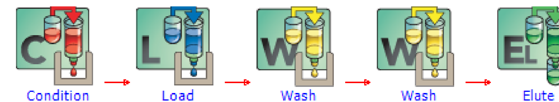
Figure 2 TRILUTION® LH method sequence

The complete SPE protocol is carried out using the Gilson ASPEC 241 Liquid Handler controlled by TRILUTION® LH Software.