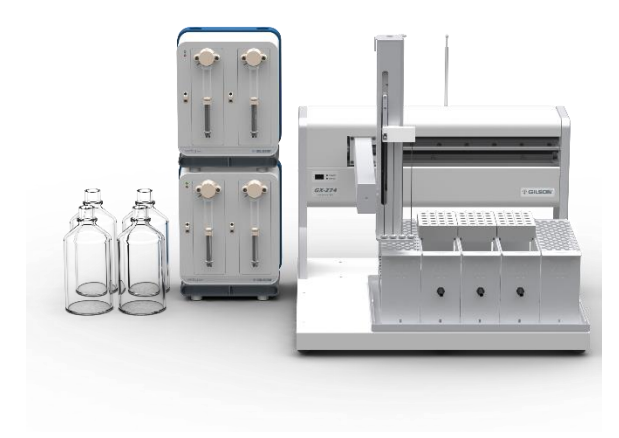
Figure 1. Image of the Gilson GX-274 ASPEC System

Positive identification of benzodiazepines using a confirmatory method of analysis is critical to correctly identifying patients using these pharmaceuticals. Simple screening tests have historically produced false positive results.<sup>2</sup>