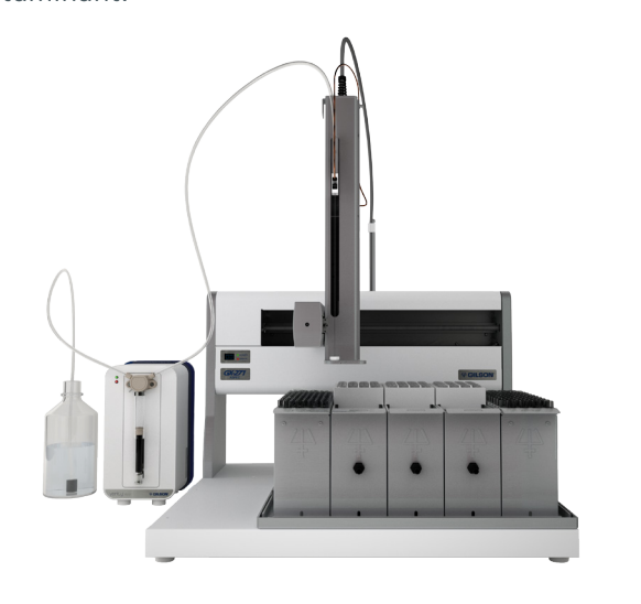
Figure 1 GX-271 ASPEC* with VERITY* 4020 Single Syringe Pump

Aflatoxin M<sub>1</sub>, the main hepatic metabolic product of Aflatoxin B<sub>1</sub>, was isolated from milk samples using the GX-271 ASPEC® system with excellent recovery, repeatability, and reproducibility. Automation of AOAC Method 2000.08 with the GX-271 ASPEC system provided a reliable, hands-off solution for the detection of this potentially carcinogenic food supply contaminant.